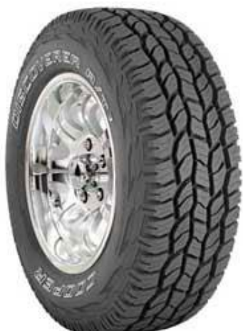
NZ Reg. Design No. 414341

To watch a video of this tyre go to https://www.youtube.com/watch?v=apDHC-Ha514